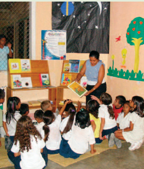
Dreams come true in a Honduras' Dream Corner

The Crutchfields generously gave $500,000 for CCF's ECD programs. The challenge is for CCF to match their gift by raising another $500,000 – meaning that every gift will be matched and doubled up to $500,000. And the gift will give more children the opportunity to move out of the poverty they were born into.