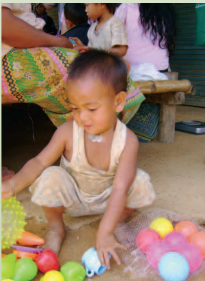
A little boy's growth is stimulated by toys