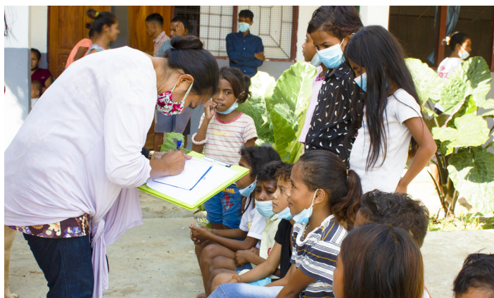
A group of children participate in emotional support activities in Timor-Leste

As the pandemic affected the daily lives of families and communities, children's exposure to violence increased. Economic uncertainty exacerbated the occurrence of family and gender-based violence; illness and death resulted in the loss of parental care for countless children; and the pandemic disrupted many prevention measures designed to protect children. 7