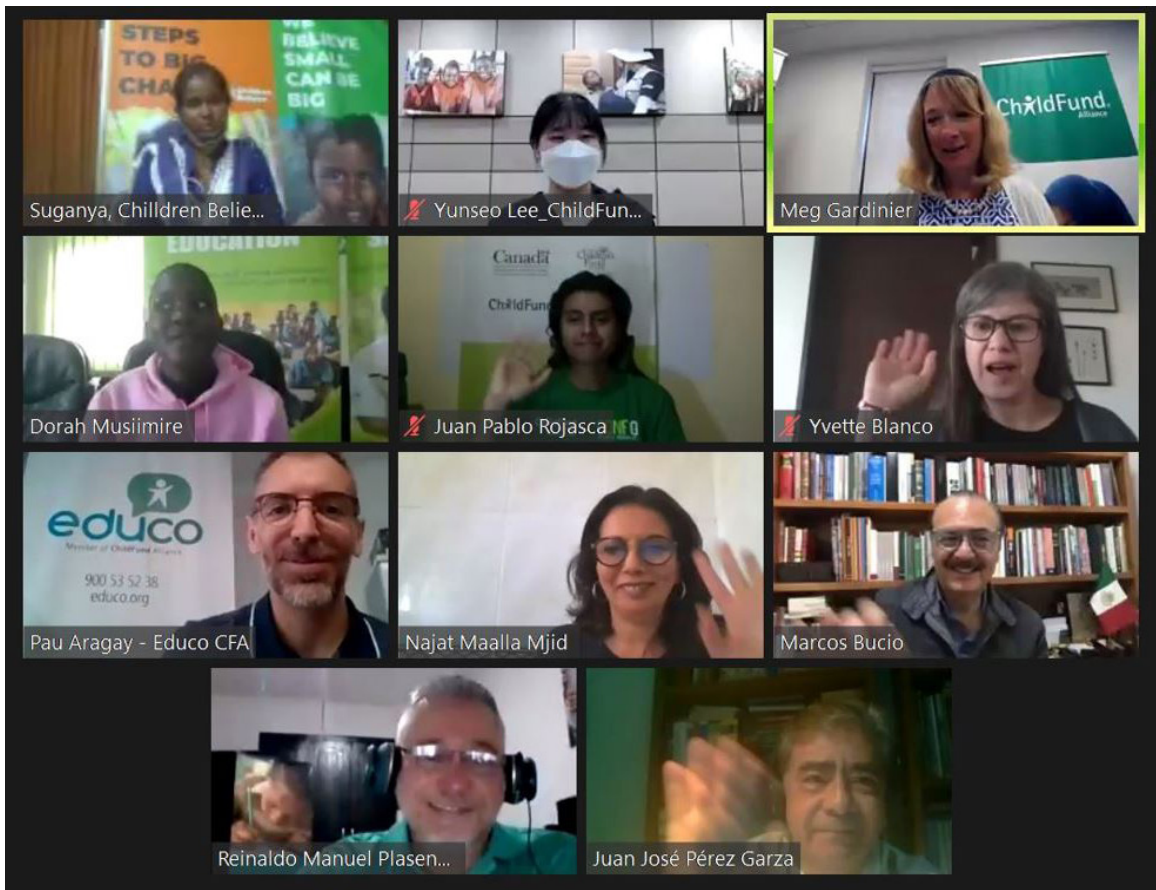
An online webinar hosted by ChildFund Alliance featured child delegates from Mexico, India, South Korea and Uganda

Engaging young people to secure their input to the COVID-19 pandemic response was a critical element of the Alliance's COVID-19 response efforts. Highlights of our child participation activities included a virtual global forum on 9 September 2020, an online event hosted on Universal Children's Day (20 November 2020), and the release in January 2021 of a policy brief on children's right to be heard.