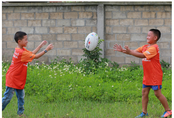
Two young boys enjoy safe playtime during ChildFund’s Sport for Development Reconnect program, hosted in Laos and Vietnam

Key achievements of Reconnect during the nine-month timeline include 80% of participants gaining correct knowledge on handwashing best practices and 64% of players stating they don’t feel helpless when faced with difficulties or challenges in life, compared to 49% at baseline.