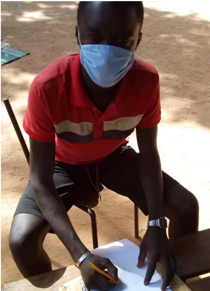
A young boy in Senegal studies remotely during the pandemic

Didactic and online materials enabled children and youth to continue their studies, despite schools closing due to the pandemic. The active support of parents was instrumental to success, with parents playing a vital role in promoting home-based education for their children. Parent support organizations helped motivate parents to participate in alternative educational resources during the pandemic.