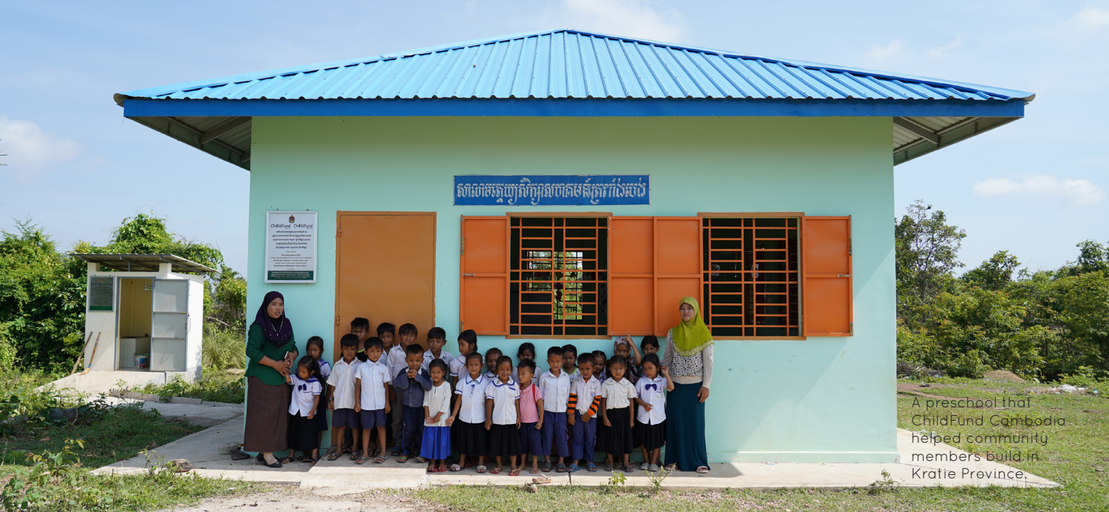
A preschool that ChildFund Cambodia helped community members build in Kratie Province.