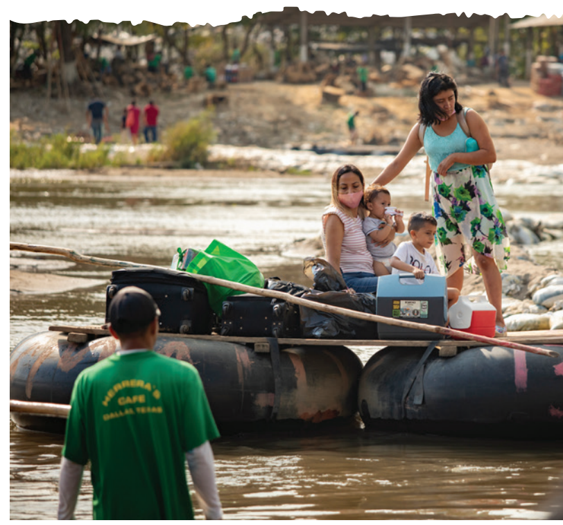
Commuters, cargo and people migrating cross the Suchiate River that forms the border between Guatemala and Mexico.

Meanwhile, further south, ChildFund Ecuador signed a cooperation agreement with the United Nations' International Organization for Migration toward sharing knowledge and complementing each other's strengths to stabilize families who have migrated from Venezuela in five Ecuadorean cities. Starting by helping women improve capacities for entrepreneurship, ChildFund's holistic approach includes protecting these families' human rights and fostering safer, more inclusive host communities that value, protect and advance their rights and welfare.